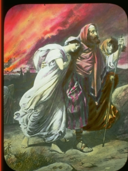
LOT AND DAUGHTERS