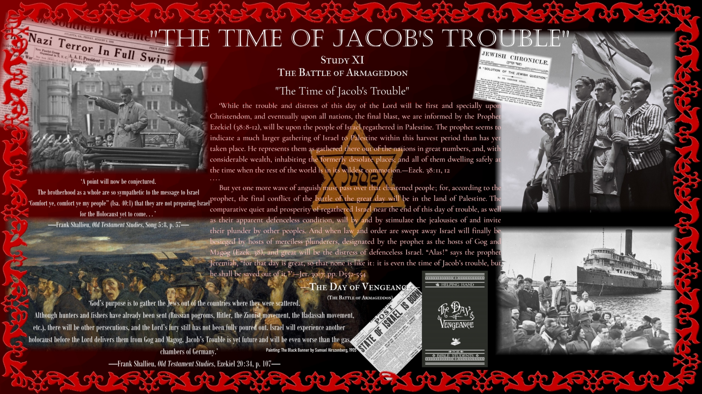
Painting: The Black Banner by Samuel Hirszenberg, 1905