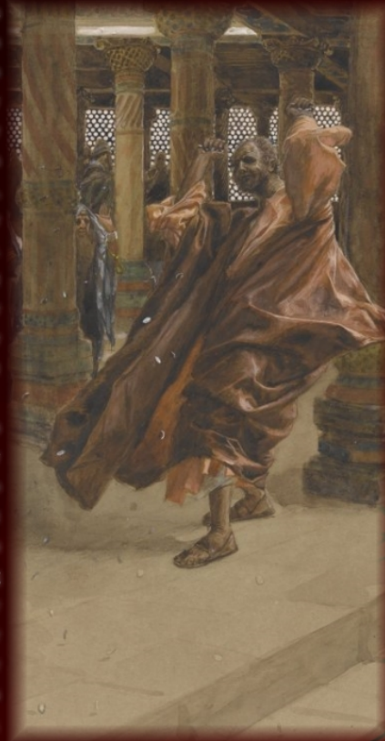
Painting: 'Judas rend l'argent' by James Tissot, 1886-94.

The mind of the Lord, inculcated by His Word, teaches that we are to love the beautiful, pure, true, noble; we are to love (in the sense of sympathising with) the weak, the penitent and oppressed, who are seeking for the paths of righteousness and truth; but we are to “ hate iniquity ” and “every false way,” and all the meanness and sin which is wilful, against light and of the Devil.