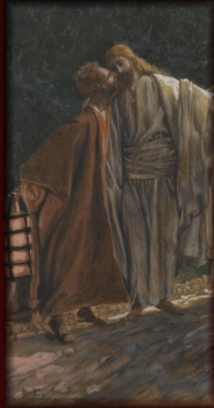
Painting: 'Le baiser de Judas' by James Tissot, 1886-94.

None of them is lost, but the son of perdition; that the scripture might be fulfilled! (John 17:12)